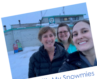
Chillin' With My Snowmies Scavenger hunt: Photo courtesy of Gail Aspelund