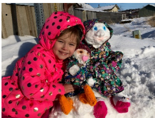
Snowman Contest